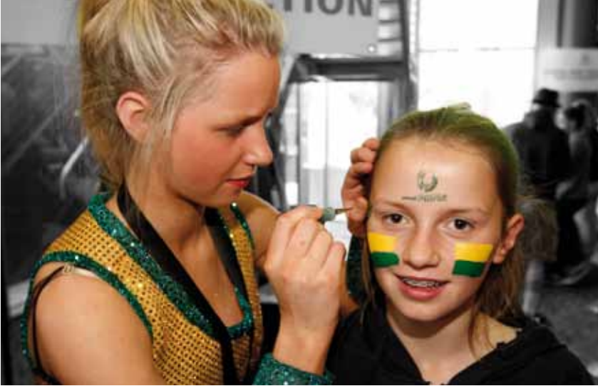
Pre-game face painting at the Holden Netball Test Series